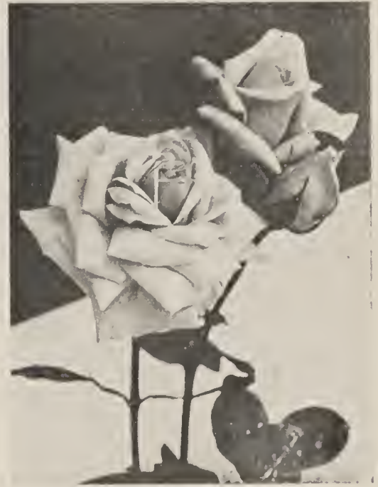
Popular Red Columbia

RADIANCE —(H. T.)—Brilliant rose-pink buds, opening to well-formed shining flowers with lighter tints on the reverse of the petals; globular in shape and very fragrant. The plant makes splendid growth, has wonderful blooming qualities.